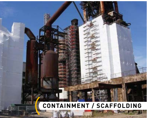
CONTAINMENT / SCAFFOLDING