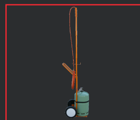
GAS BOTTLE TROLLEY